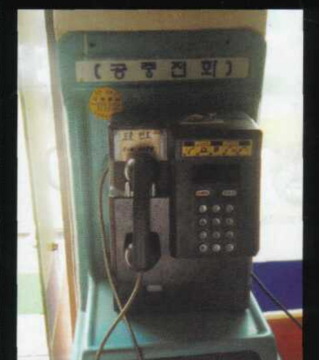
Kyeonghee University. The old style coins-only payphone which is becoming increasingly rare.